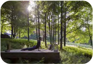
YOGA/ VIEWING DECK