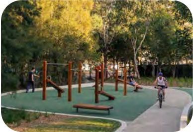
OUTDOOR FITNESS EQUIPMENT