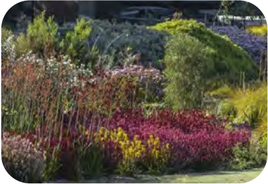
NATIVE SENSORY GARDEN BEDS