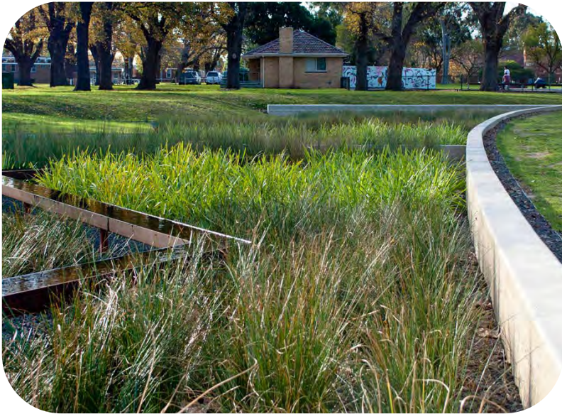
BASALT PLAINS GRASSLAND