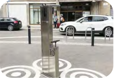
BIKE PUMPING STATION