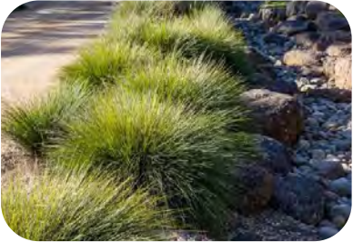
ROCK SWALE WITH WSUD PLANTING