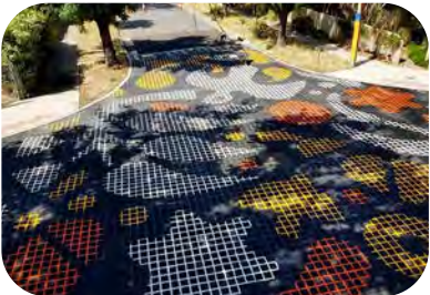
TRAFFIC CALMING GRAPHIC