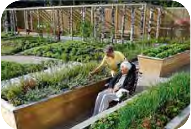
ACCESSIBLE RAISED GARDEN BED