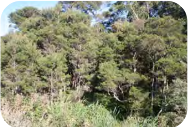
RIVER RED GUM GRASSY WOODLAND