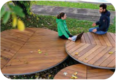
MULTI-USE PLATFORM/ DECK