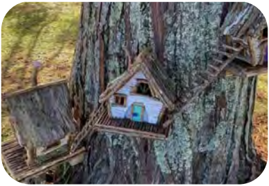
FAIRY TREE CIRCLE