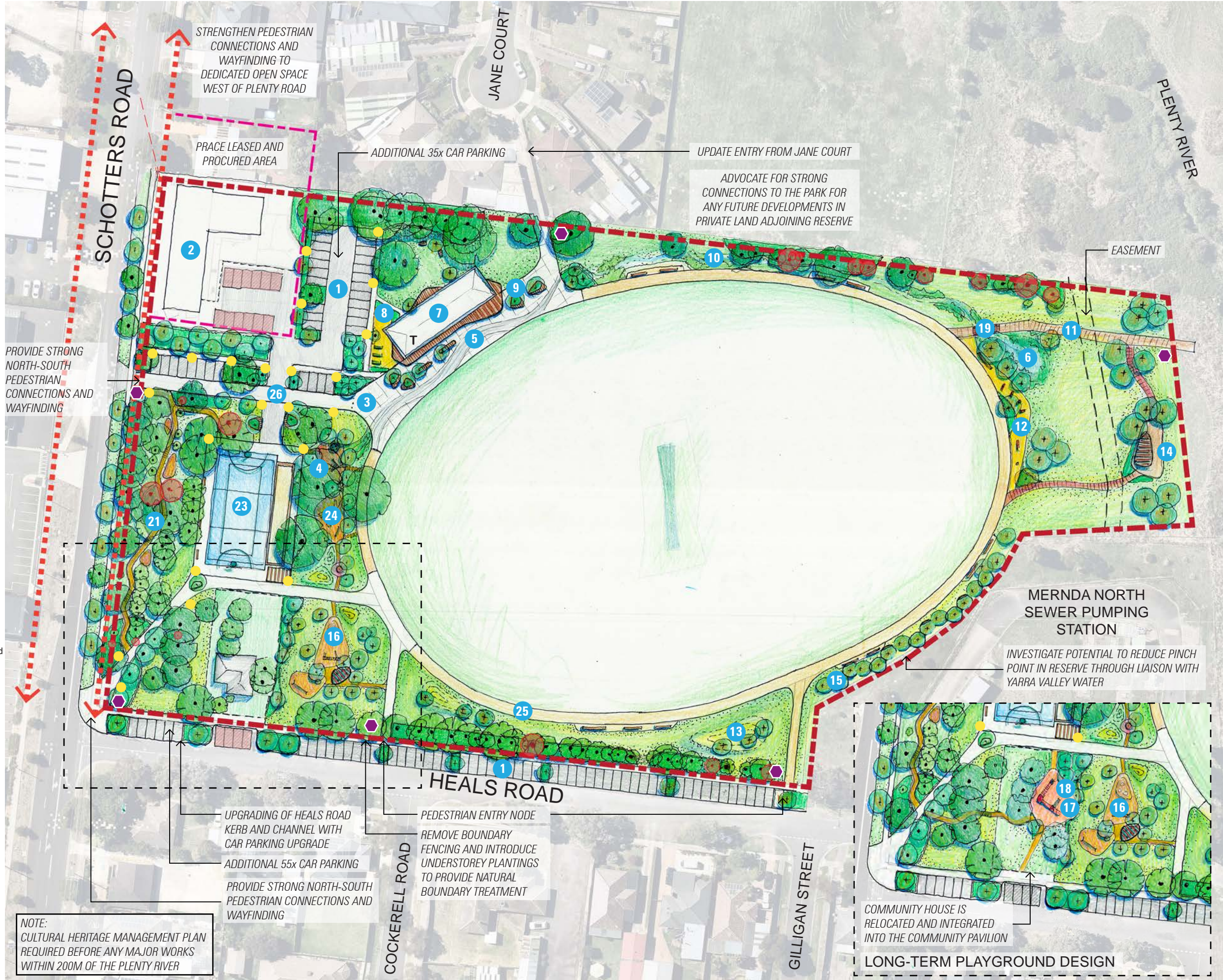
Figure 1 Masterplan Concept Plan