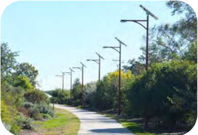
SOLAR POLE LIGHTING