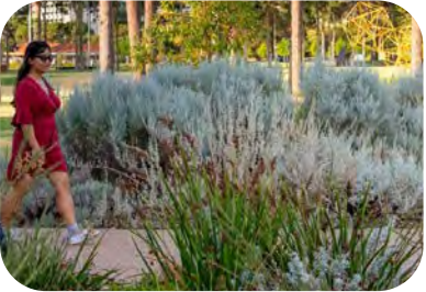
PLANTING ALONG PATHS AND BOUNDARIES