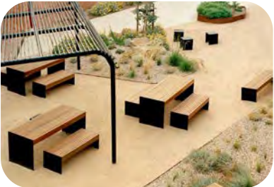
SHELTER & SEATING