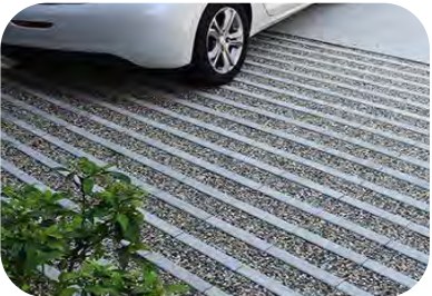
PERMEABLE CAR PARK