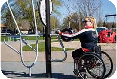
ACCESSIBLE FITNESS EQUIPMENT