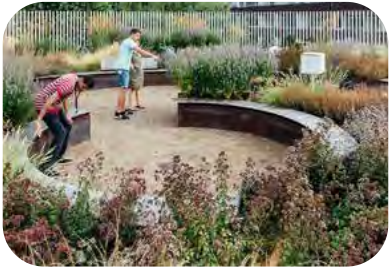
SENSORY GARDENBEDS WITH SEATING