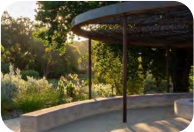
SHELTER & SEATING