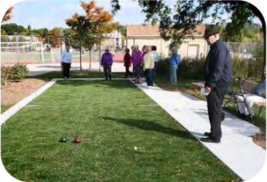
BOCCE BALL COURT