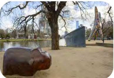
SITE SPECIFIC COMMISSIONED SCULPTURE