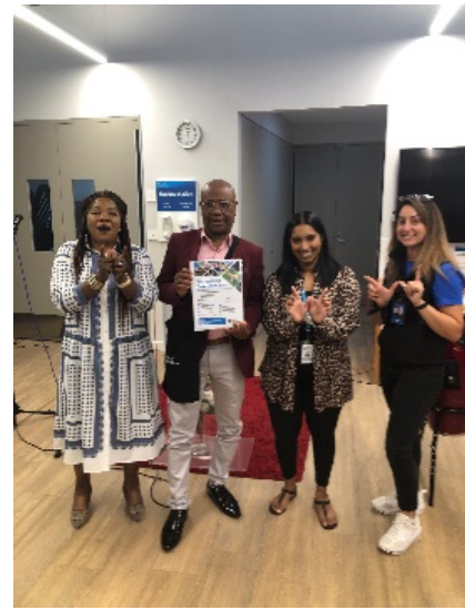
Above L-R: Punjabi Men's Group at Galada providing feedback on the Local Law review; and project team..