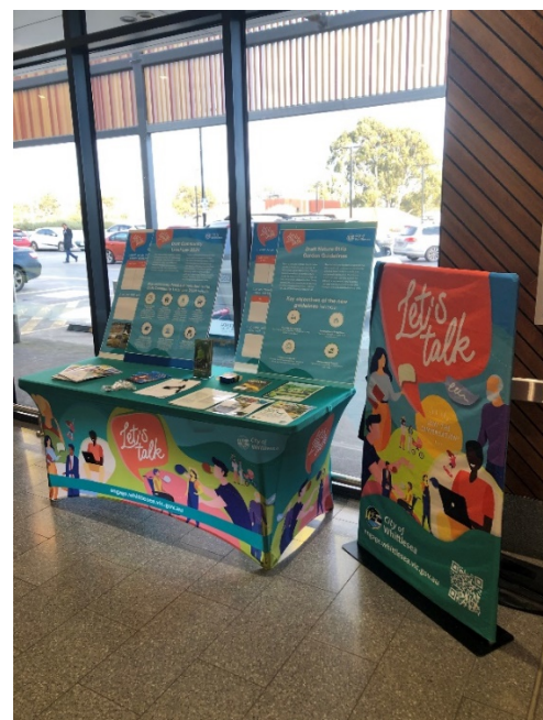
Above (L – R): The project team engaging with the community at Westfield Plenty Valley and Mernda Junction Shopping Centre.