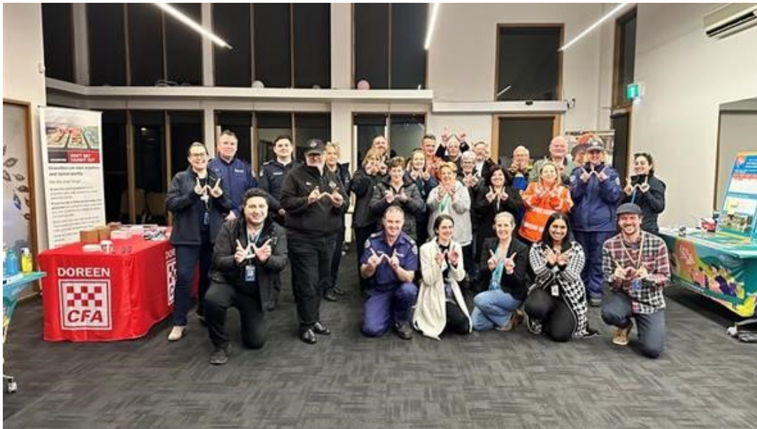
Above: The Safer Communities and Community Local Law Roadshow at the Brookwood Community Centre in Doreen.