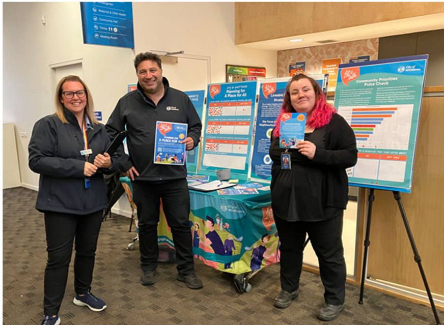
Above: Project team engaging at the Mernda Village Community Activity Centre.

The seven community-based pop-ups held were: